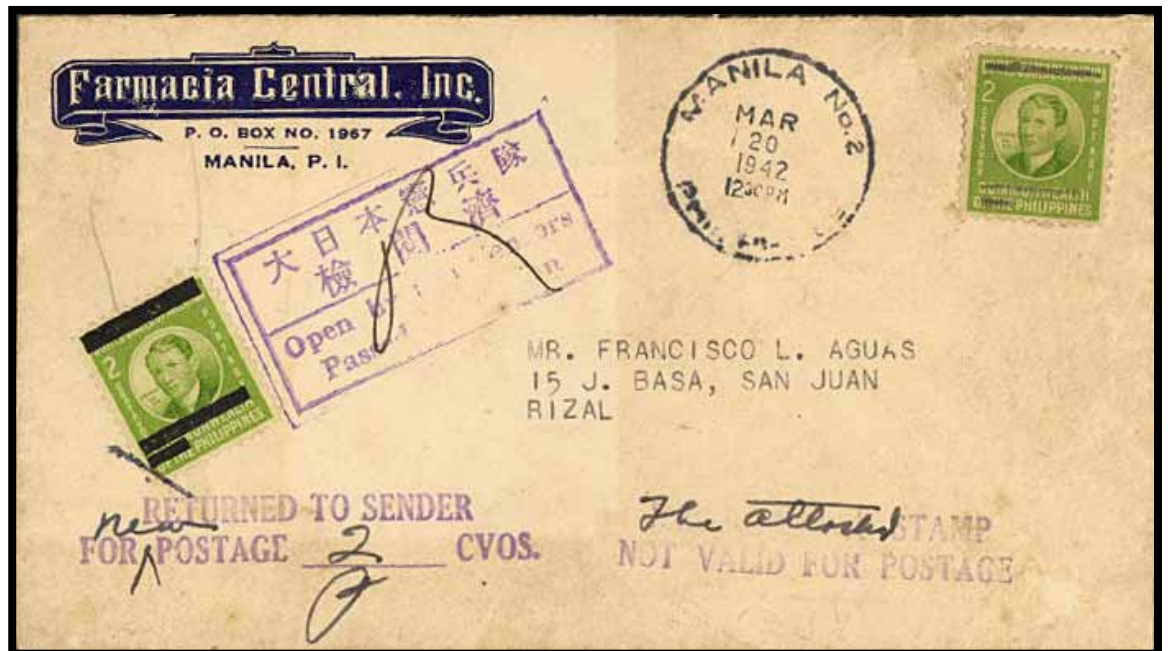
March 20, 1942, Manila, self- altered prewar stamp rejected

Bars overprint: UNITED STATES OF AMERICA / COMMONWEALTH / OF THE