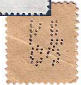
③ Company Perforated Initials. Chartered Bank of India, Australia & China (CBI) (top) Philippine Education Company—double PE (bottom)

④ Special Imperforate Stamps. Requested and printed for the Lambert Sales Company in Manila and used by them to send embroidery goods to their New York, NY office using these labels in 1925. This series previously issued to the public only with perforations.