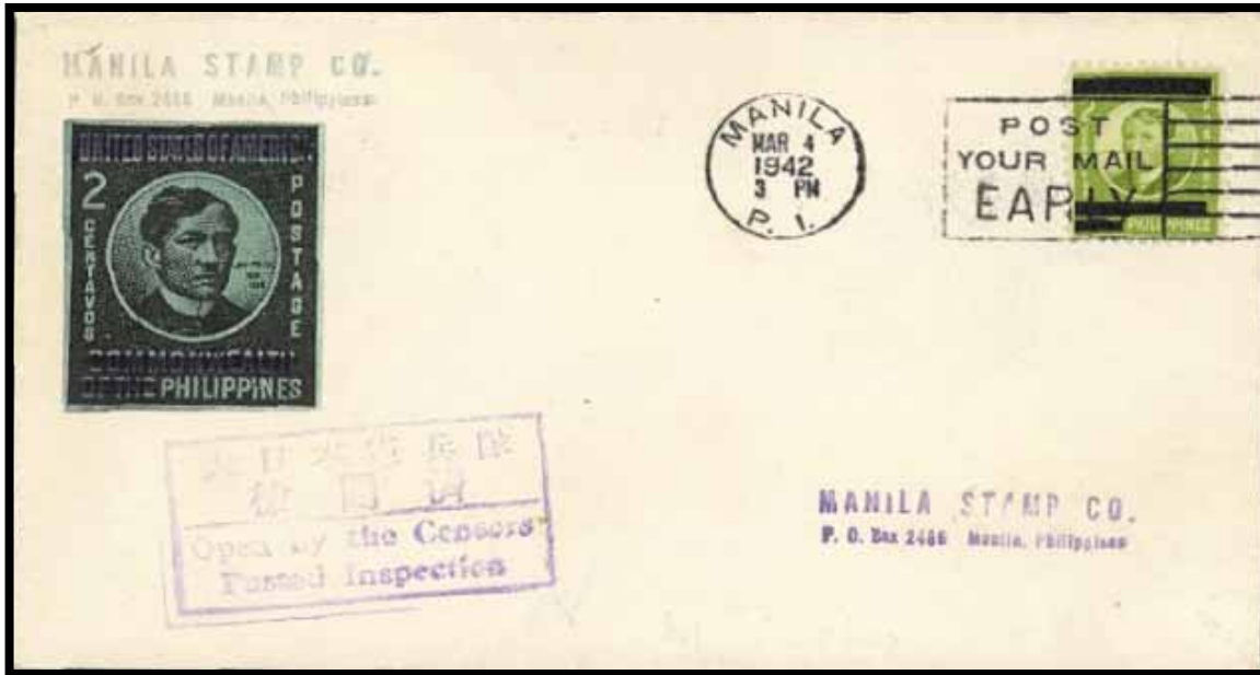
First Issue Mar 4, 1942 Manila First Day Cover.

The Japanese Military complex attacked the Philippines in December 1941. By March 1942, the Japanese had sufficient control over major portions of the country to reopen the postal system. The first stamps used were prewar issues overprinted to reflect the new control.