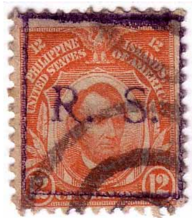
② Company Hand Stamp. Rambler Shoe Company