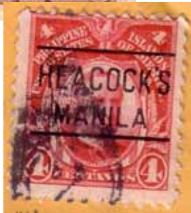
① Manila Printed Overprint. Camera Supply Company (top) H.E. Heacock Co. (below)