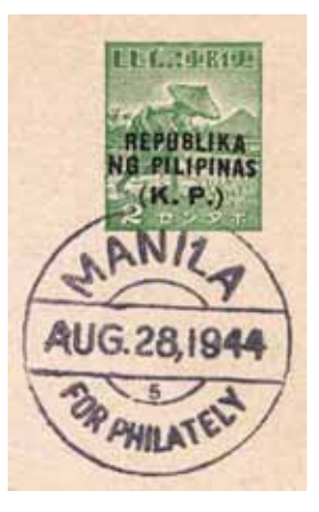
Japanese Occupation. KP–Kagamitang Pampamahalaan–is Tagalog for OB. First day cancel doubles as control (clerk #5 of 11).