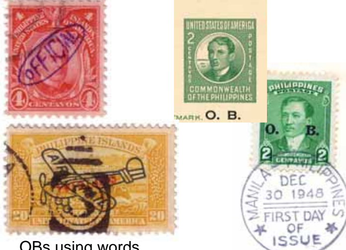
OBs using words. OFFICIAL within oval (top) and separate– red invert–(bottom), TAGLE inspired.