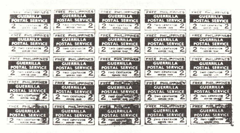
Figure 1. Full sheet of the 2-centavo blue-on-white Philippine Guerrilla stamps issued by the "Free Philippines," 10th Military District, Esperanza, Mindanao.

Virtually all that is known of the stamp is found in a 1949 study<sup>1</sup> by Pablo Esperidion of the Philippines, and a subsequent study in 1961<sup>2</sup> by Arnold H. Warren of the United States.