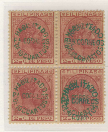
Double Surcharge Pos. 2, 4