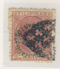
Inverted Surcharge Colonial Parilla cancel