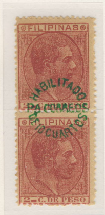
Shared Surcharge (APS Cert.)