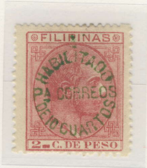
Green 10c on 2c Carmine Postage