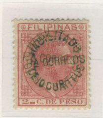
Double Surcharge (APS Cert.)