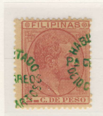
Split Surcharge Vertically