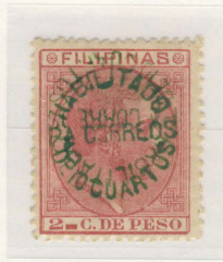
Double Surcharge One Inverted