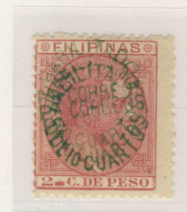
Triple Surcharge (APS Cert.)