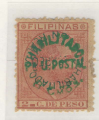
One Real Inverted