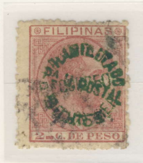
Postally Used Colonial Parilla cancel (APS Cert.)