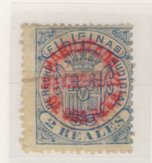
Doubled 8c Surcharge One Inverted