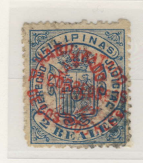
Double Surcharge Postally Used