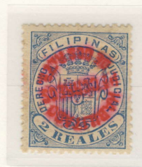
Red Two Reales Inverted