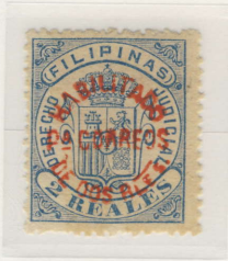
Red Two Reales on Two Reales Blue Revenue