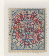
Inverted 8c Surcharge

This is the only stamp which used the Type 9 surcharge. This surcharge differs from the Type 10 in the central line of the surcharge, i.e., the Type 9 reads "P A Correos," while the Type 10 reads "P A U. Postal."