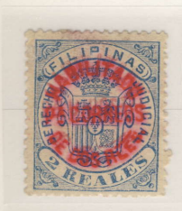
Double Surcharge - Red Two Reales (Type 8) on Pink 8c (Type 10) on Two Reales Blue Revenue

This is the only stamp which used the Type 9 surcharge. This surcharge differs from the Type 10 in the central line of the surcharge, i.e., the Type 9 reads "P A Correos," while the Type 10 reads "P A U. Postal."