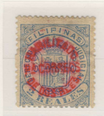
Double Surcharge - Red Two Reales (Type 8) on Pink 8c (Type 9) on Two Reales Blue Revenue

Issued: January, 1882 No. Surcharged: 20,000