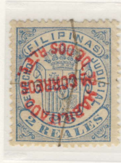
Inverted Surcharge ms. cancel