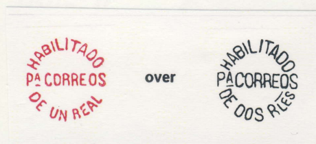
Double Surcharge - Red One Real (Type 5) on Black Two Reales (Type 8) on 5c Gray Postage (APS Cert.)