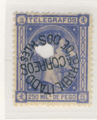
Inverted Surcharge Telegraph Punch cancel