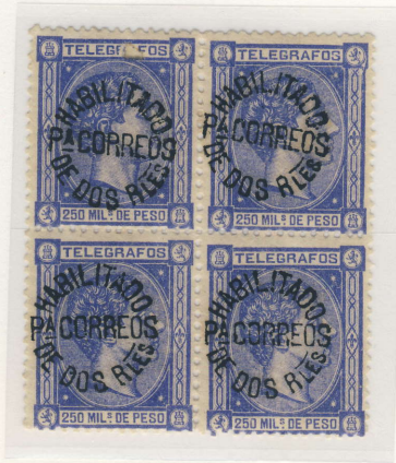
Elusive Unused Multiple