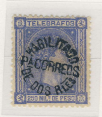
Black Two Reales on 250 Mils. Ultramarine Telegraph