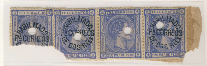
Omitted Surcharge - middle stamp in strip of 3 Punch cancel on piece of Telegraph Receipt (Omitting the surcharge did not affect the telegraph fee, as 250 Miliesimas and 2 Reales both equal 25 centavos.) Only Example Recorded