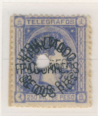
Double Surcharge Telegraph Punch cancel on piece