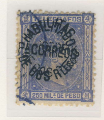
Double Surcharge Postally Used