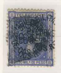
Triple Surcharge Only Example Recorded