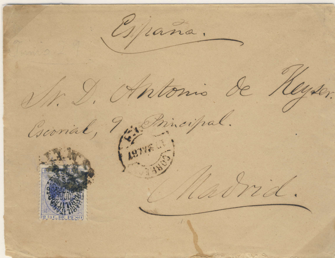
Manila to Madrid, Spain , May 19, 1887. Rec. June 29 th .

25c double weight (Spain and Colonies) rate, up to 1 oz.