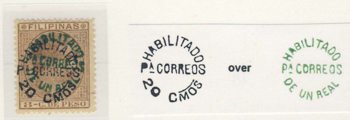
Double Surcharge - Black 20c (Type 7) on Green One Real (Type 5) on 8c Brown Postage (APS Cert.)