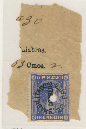
Sideways Surcharge on piece of Telegraph Receipt (APS Cert.) Only Example Recorded