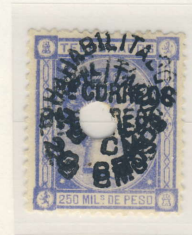
Triple Surcharge Punch cancel Only Example Recorded