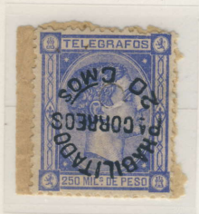
Inverted Surcharge on piece of Telegraph Receipt

As indicated on the APS Certificate, this mint example has full original gum which has never been hinged. This is the Only Example Recorded of this stamp in its full original state of preservation.