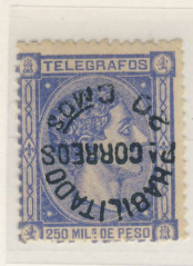
Inverted Surcharge (APS Cert.)

As indicated on the APS Certificate, this mint example has full original gum which has never been hinged. This is the Only Example Recorded of this stamp in its full original state of preservation.