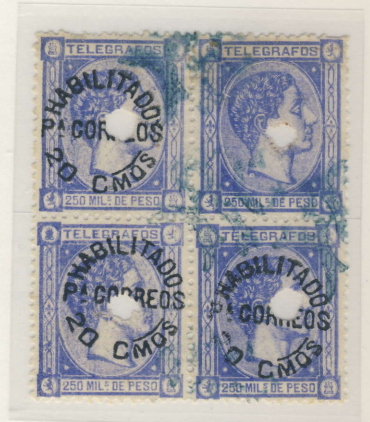
Omitted Surcharge Top/Right Stamp Blue YTC cancel and Punched (APS Cert.) Only Example Recorded