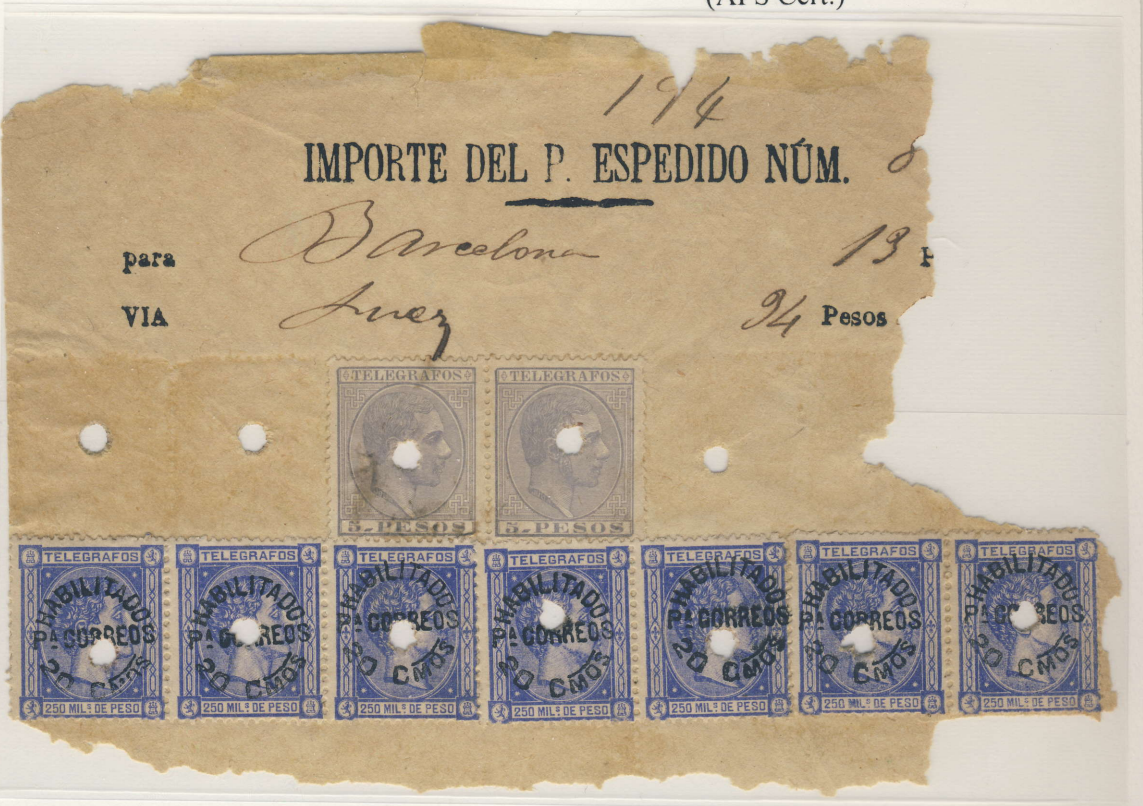
Strip of Seven Used on Piece of Telegraph Receipt with Pair of Five Pesos Telegraph Stamps (1880) (APS Cert.)