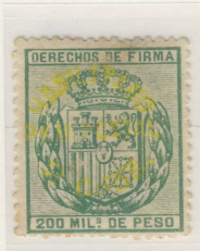
Yellow 2c on 200 Mils. Green Revenue