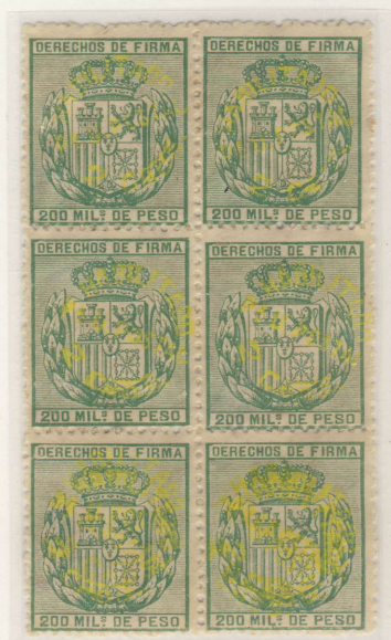
Double Surcharge Bottom Horizontal Pair