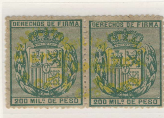
Additional Surcharge Between