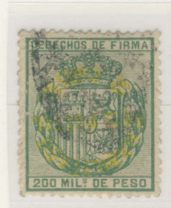
Inverted Surcharge Fiscal cancel