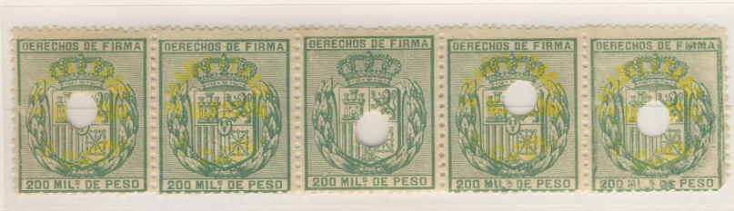
Strip of Five Surcharge Omitted from Center Stamp Punch Cancel (either Telegraph use or Remainder) Only Example Recorded