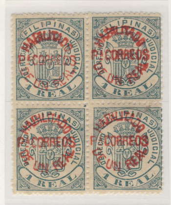
Block of Four Only Recorded Multiple (APS Cert.)