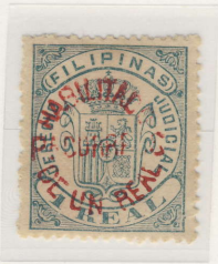
Red One Real on One Real Green Revenue (APS Cert.)