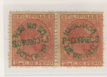
Inverted Surcharge - Left Stamp