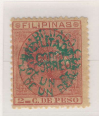
Double Surcharge (APS Cert.)