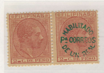
Omitted Surcharge - Left Stamp (APS Cert.)