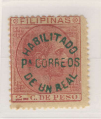
Green One Real on 2c Carmine Postage

Issued: October, 1883 No. Surcharged: 10,000