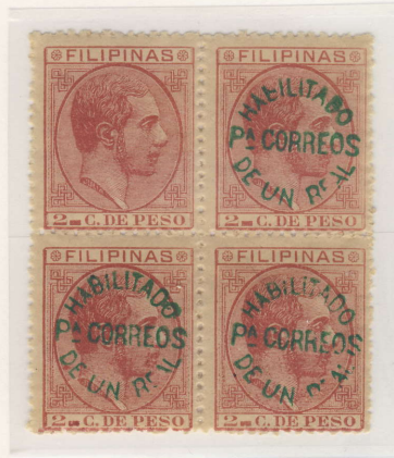
Omitted Surcharge Top/Left Stamp