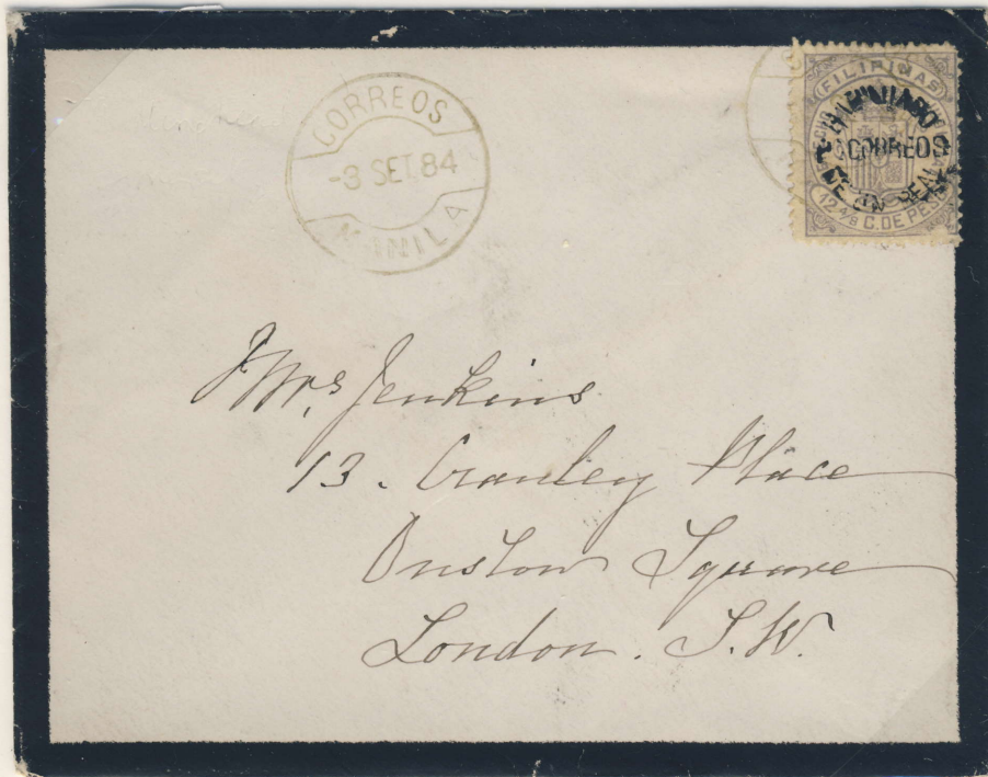
Manila to London, England, September 3, 1884. Rec. Oct. 9 th . (Mourning cover) 8c single weight rate to overseas destinations, up to ½ oz. (Overpaid 4½c - convenience franking.)