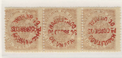
Double Surcharge Both Inverted on Left Stamp Inverted Surcharge on Right Stamp