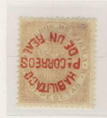
Inverted Surcharge (APS Cert.)