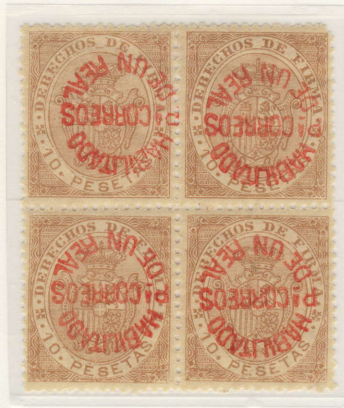
Block of Four Inverted Surcharge - Each Stamp (APS Cert.)