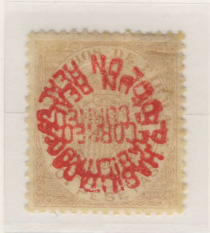
Double Surcharge Both Inverted