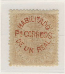
Red One Real on 10 Pesetas Bistre Revenue

Issued: June 4, 1883 No. Surcharged: 4,000