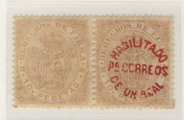
Omitted Surcharge - Left Stamp (APS Cert.)