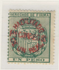
Red One Real on One Peso Green Revenue

Issued: June 4, 1883 No. Surcharged: 10,000