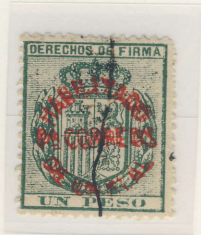
Double Surcharge ms. cancel