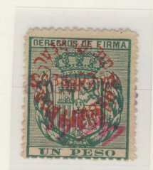
Double Surcharge Both Inverted