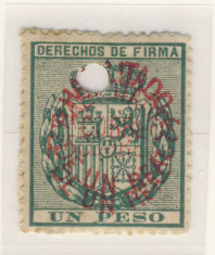
Double Surcharge Telegraph punch cancel