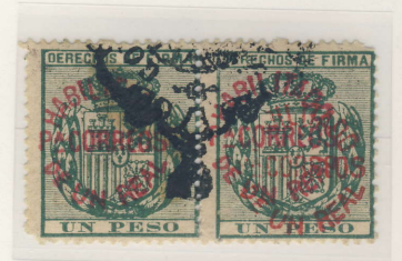
Double Surcharge - Right Stamp Fiscal Cancel