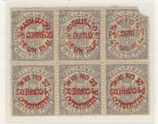
Inverted Surcharge - Bottom Three Stamps

The handstamp used to apply this surcharge and the black surcharge to the same stamp was worn and/or damaged as a result of over-use. As a result, the surcharges on both stamps are usually characterized by broken or incomplete letters, and a general blotchy appearance.