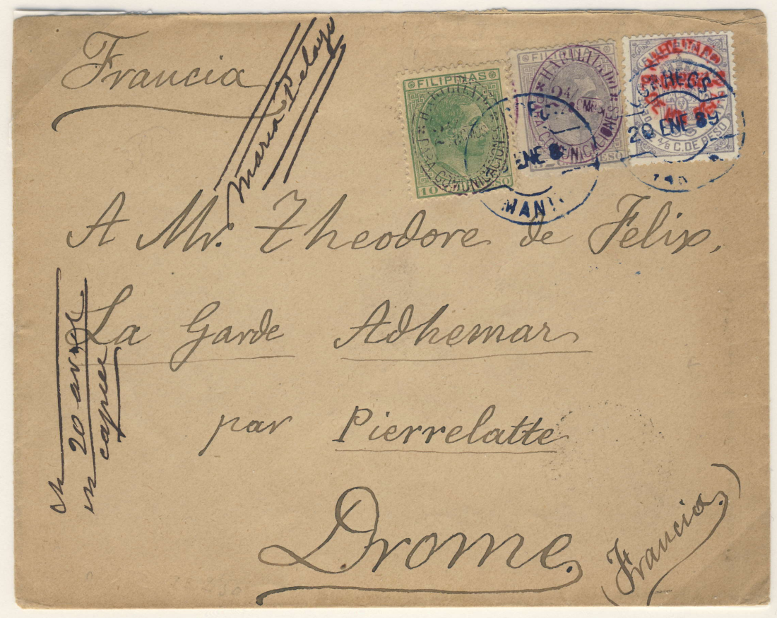
Manila to Pierrelatte , Drome , France , January 20, 1889. Rec. Feb. 16<sup>th</sup>. 16c double weight rate to overseas destinations, ½-1 oz. (Overpaid 1½c)