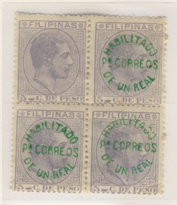
Omitted Surcharge Top/Left Stamp (APS Cert.)