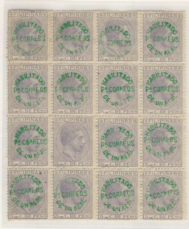
Omitted Surcharge from Position 10 in Block of 16 (APS Cert.)