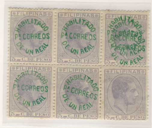
Double Surcharge Top/Right Stamp Omitted Surcharge Bottom/Right Stamp