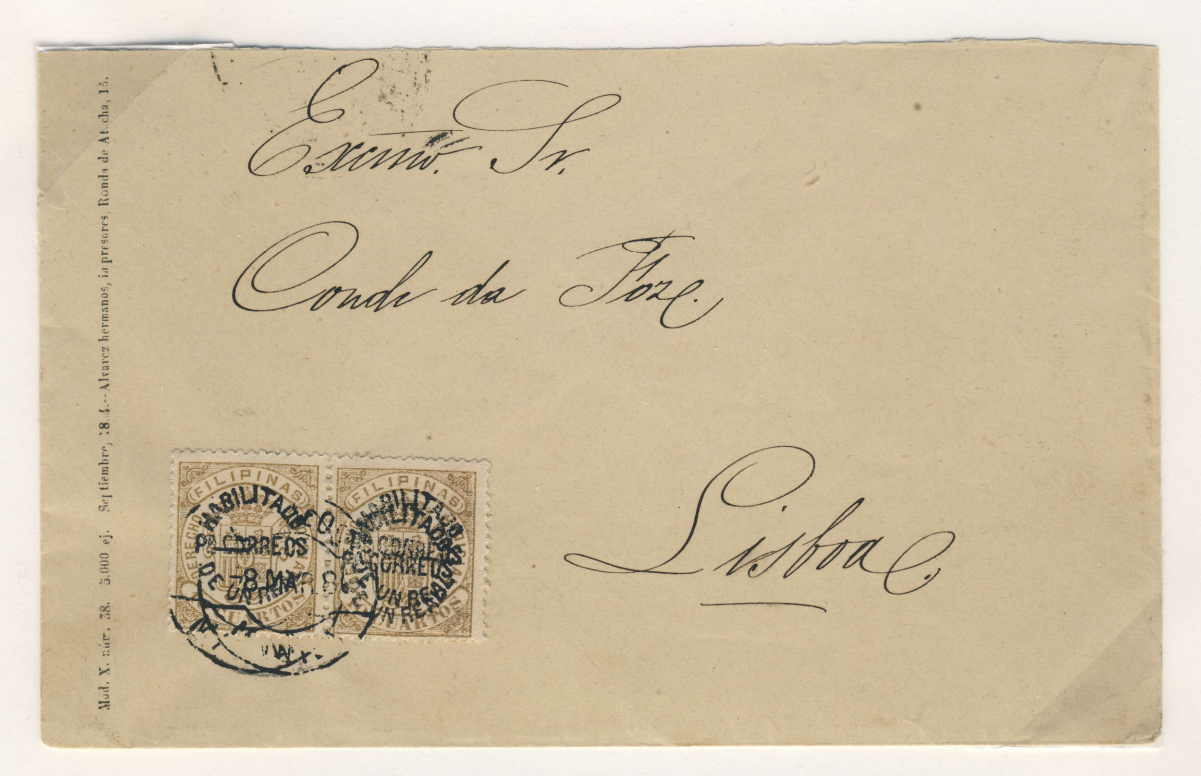
Manila to Lisbon, Portugal, March 8, 1886. Rec. April 24<sup>th</sup>. Double Surcharge - right stamp in pair 24c triple weight rate to overseas destinations, 1-1½ oz. (Overpaid 1c)