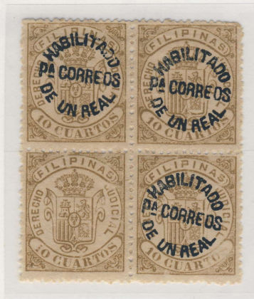
Omitted Surcharge - Bottom/Left Stamp (APS Cert.)