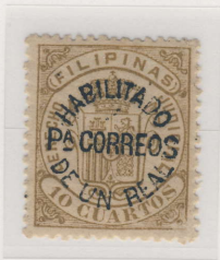
Black One Real on 10 Cuartos Bistre Revenue