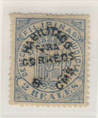
Black 8c on 2 Reales Blue Revenue