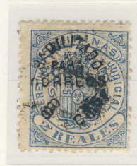
Double Surcharge Postally Used