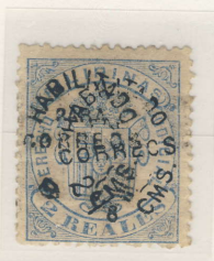
Unused (APS Cert.)