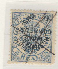
Double Surcharge Both Inverted ms. cancel