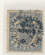
Postally Used (APS Cert.)