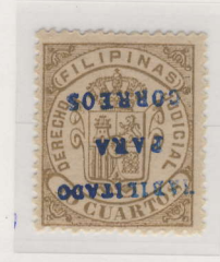
Inverted Overprint (APS Cert.) Only Recorded Overprint Error