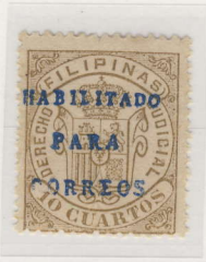
Blue Overprint on 10 Cuartos Bistre Revenue (APS Cert.)