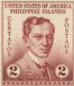
Large Die Trial Color Proof in Lake Die Sunk on Card (1934) Three Examples Recorded

Both rose Rizal booklet panes were printed with a 360 subject flat press printing plate. While the BEP originally intended to issue the panes unoverprinted, by 1936 all stamps in the series were being overprinted with the large "Commonwealth." Thus, no rose Rizal booklet stamps are found without the overprint. The plate numbers were entered in the vertical selvedge, adjacent to the stamps at positions 1, 20, 341 and 360. The side selvedges were trimmed off when the sheet was cut into panes, so none exist with plate numbers. Arrows and guidelines were not entered onto the original plate, but were added prior to making the small "Commonwealth" panes. Line position panes can be found on those panes in positions B, C, H, I, J, K and L.