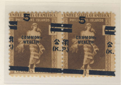
Severely Misplaced Surcharge (Printer's waste, looted from the vault in the Manila Central Post Office during the battle for the liberation of the city.) Six Examples Recorded

All Official Stamps during the Occupation were printed with the Japanese characters, "KoYo" and the abbreviation, "K.P." which is Tagalog for "Kagamitang Pampamahalaan" which means "Official Business."