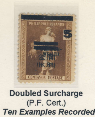
Doubled Surcharge (P.F. Cert.) Ten Examples Recorded