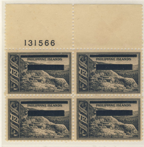
Created to pay the 12c. Registry rate which was reduced from 16c. effective March 1, 1943