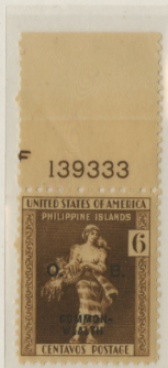
Second Printing 11.1mm

The horizontal spacing varied with the two printings of this stamp. In the first printing the spacing between the periods is 12.5mm. Few examples survive. In the second printing, the distance between the periods is 11.1mm.