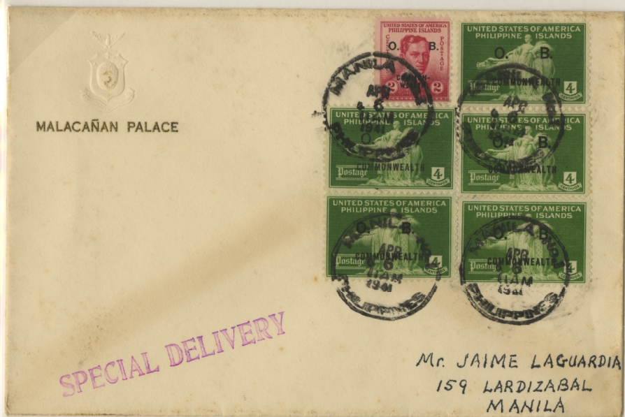
Internal Cover, Apr. 6, 1941; 2c. First Class Rate, 1-20g; 20c. Special Delivery