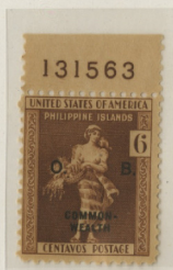
First Printing 12.5mm