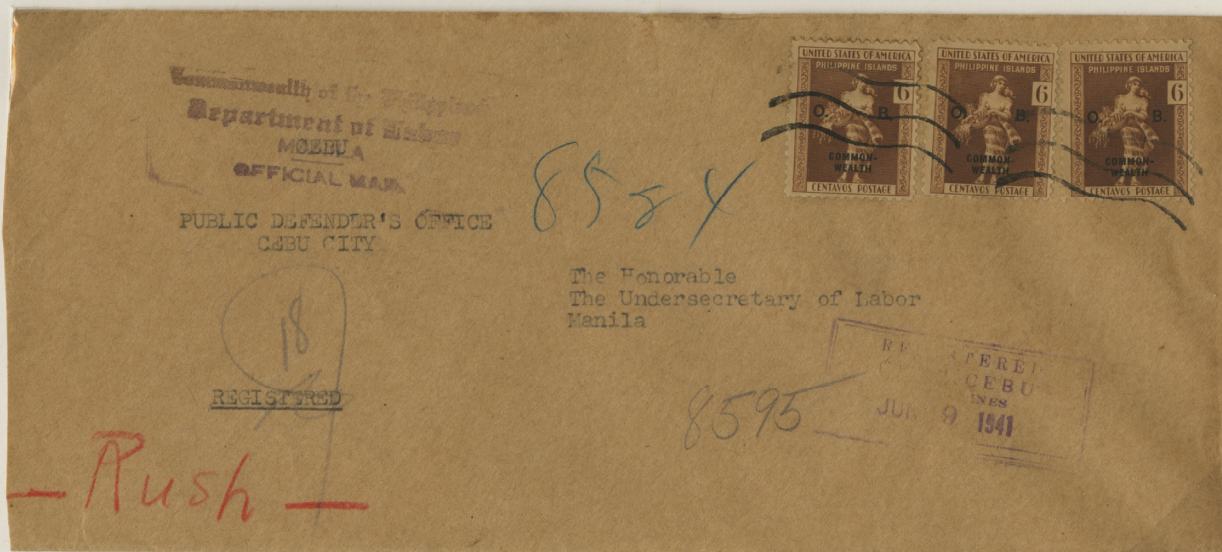
Cebu, Cebu to Manila, June 9, 1941. 2c. Internal First Class Rate, 1-20g.; 16c. Registry Spacing Variety - 12.5mm Between the Periods all Three Stamps