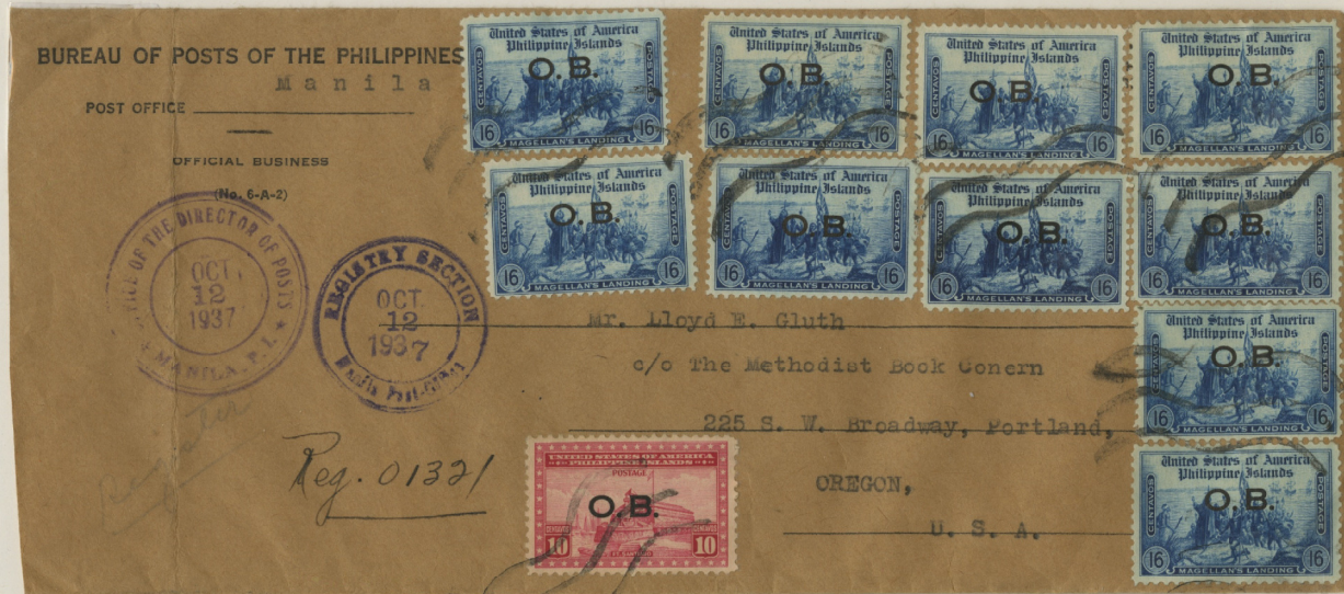
Manila to United States, Oct. 12, 1937. P1.50 Clipper Rate, 1oz. or less; 20c. Registry