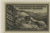
"O" Omitted Only Example Recorded