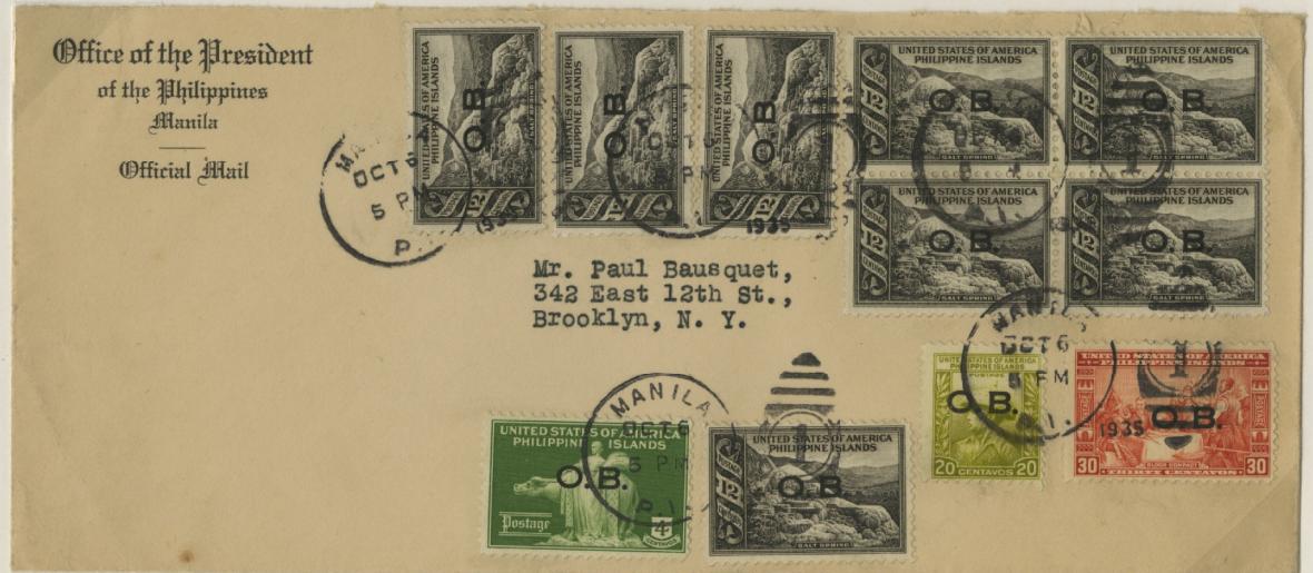
Manila to United States, Oct. 6, 1935. P1.50 Clipper Rate, 1oz. or less