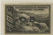
Omitted Period after "B" Two Examples Recorded