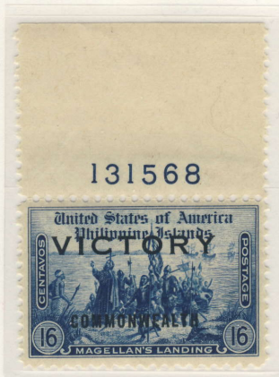
7.5mm Spacing Between Victory and Commonwealth (Wide Spacing Var.)