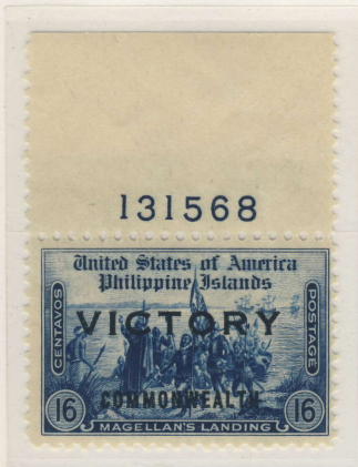
5.5mm Spacing Between Victory and Commonwealth (Narrow Spacing Var.)