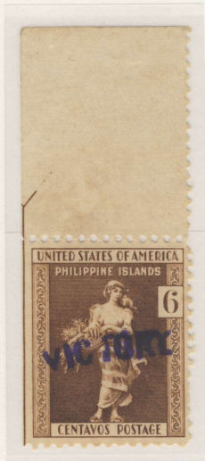
On 1935 Issue (APS Cert.)

No. Printed: 64 (1935 issue) and 206 (Large Commonwealth) Date Issued: Dec. 8 and Dec. 28, 1944