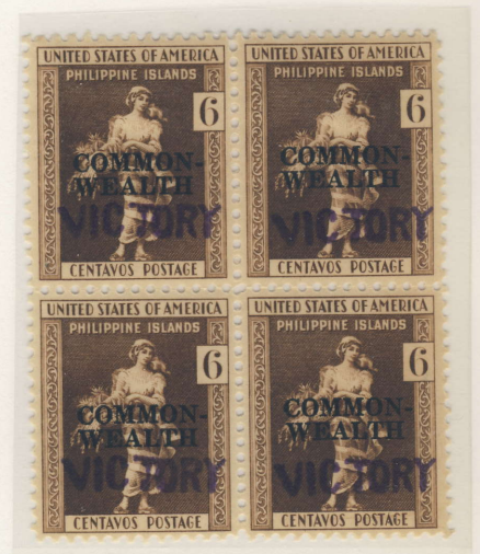
On Large Commonwealth