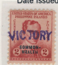
On Small Commonwealth 6 Examples Recorded

All Large Commonwealth "Victory" Stamps come from Booklet Panes and have at least one straight edge.