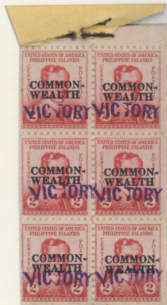
(Photocopy of Pane from Booklet)