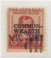
On Large Commonwealth 72 Examples Recorded

No. Printed: 168 (Large) and 41 (Small) Date Issued: December 3-14, 1944