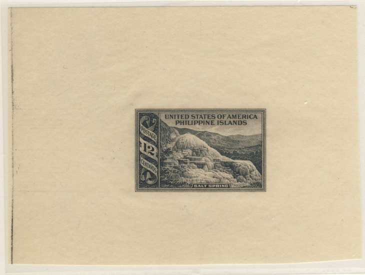
Large Die Proof Five Examples Recorded