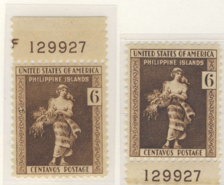
Only one plate was used to print the 6c.

The 6c. stamp was the only stamp in the series to be printed in sheets of 256, and cut into four panes of 64 stamps, each with a single plate number at either the top or bottom of the sheet.