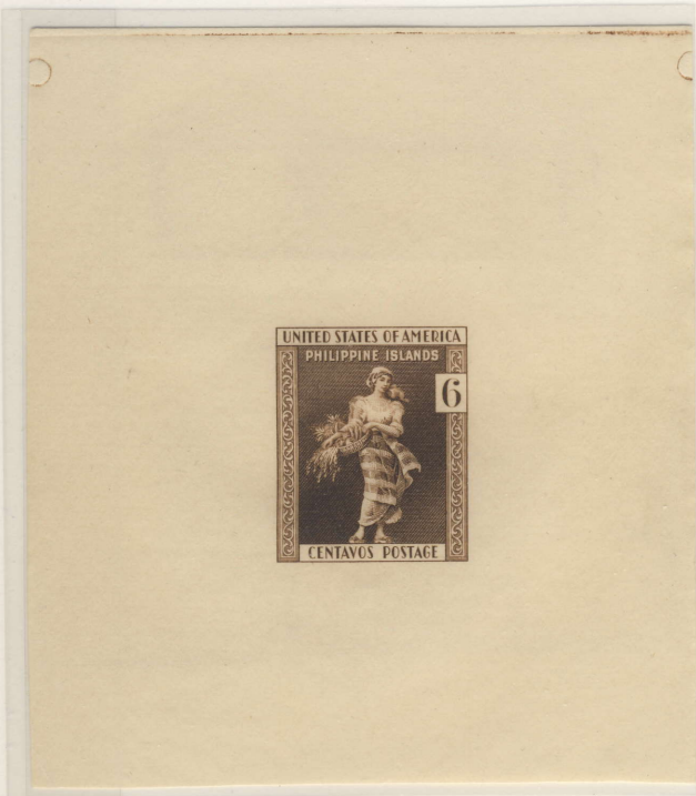
Large Die Proof Five Example Recorded