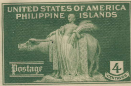
LARGE DIE PROOF Five Examples Recorded