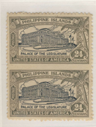
Vertical Pair - Imperforate Horizontally Between Ten Examples Recorded