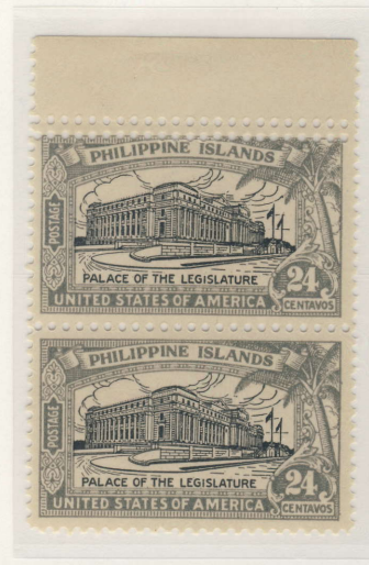
Double Horizontal Perforations at Top Margin Two Examples Recorded

The Twenty-Four centavos stamp was issued to pay the following rates: In the United States and Possessions , it paid the fee for a single-weight (up to one ounce) First Class registered letter (4 + 20) and the Fourth Class Rate for each pound. In the Spanish-American Postal Union Countries it paid the fee for a single-weight (up to one ounce) First Class registered letter and a single-weight (0-4oz.) registered Sample of Merchandise letter (4 + 20). In all other Foreign Countries it was intended to pay the double-weight First Class Rate, 21-40g (16c for first 20g, plus 8c for each additional 20g.)