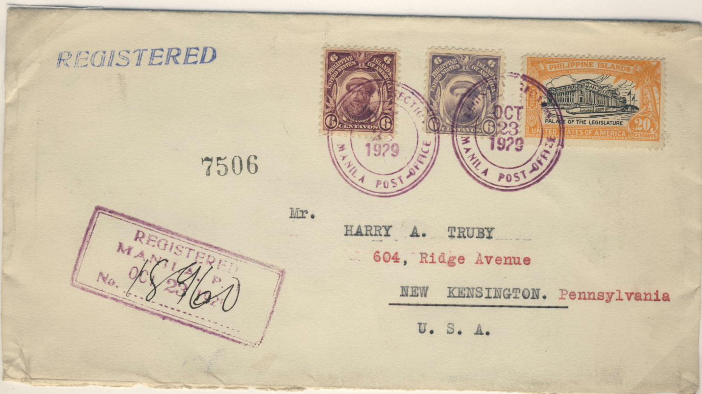
Manila to United States, Oct. 23, 1929. Rec. Nov. 23 rd 12c First Class Rate to U.S., 2-3 ounces, 20c Registry

This cover, and the two cover on the preceding page, as well as others in this exhibit are so-called "Bruggmann" covers. Walter Bruggman was a noted philatelist in the Philippines in the early part of the 20 th Century. He had an affinity for flight covers, registered covers and had significant correspondence with people all over the world. His covers can often be recognized by the use of both red and black ink in the address. He was fond of the Palace issue and utilized it in his mailings. Other than flight covers, his covers are not philatelic to the extent they are almost all properly franked and pay the correct postage rates.