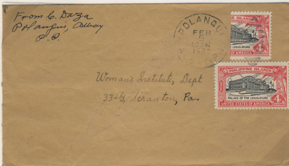
Polanqui, Albay to United States Bisect of 4c to pay 6c First Class Rate to U.S., each ounce (Rate to U.S. increased from 4c/oz to 6c/oz, end of 1932)