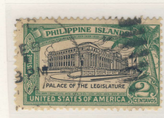
Central Vignette Shifted up and right