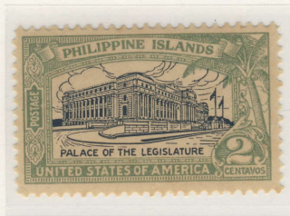
Olive Green Only Example Recorded

Bureau records indicate several sample sheets of the Two Centavos stamp were initially prepared in olive green on gummed stamped paper and perforated. Seeing the stamp in this final form, the director of the Bureau of Posts concluded it was a less desirable choice than the green color also being considered and ordered the initial run destroyed.