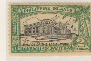
Central Vignette Shifted Down into Frame