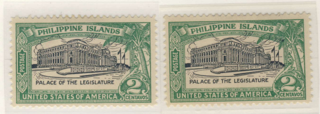
Central Vignette Shifted Up into Frame