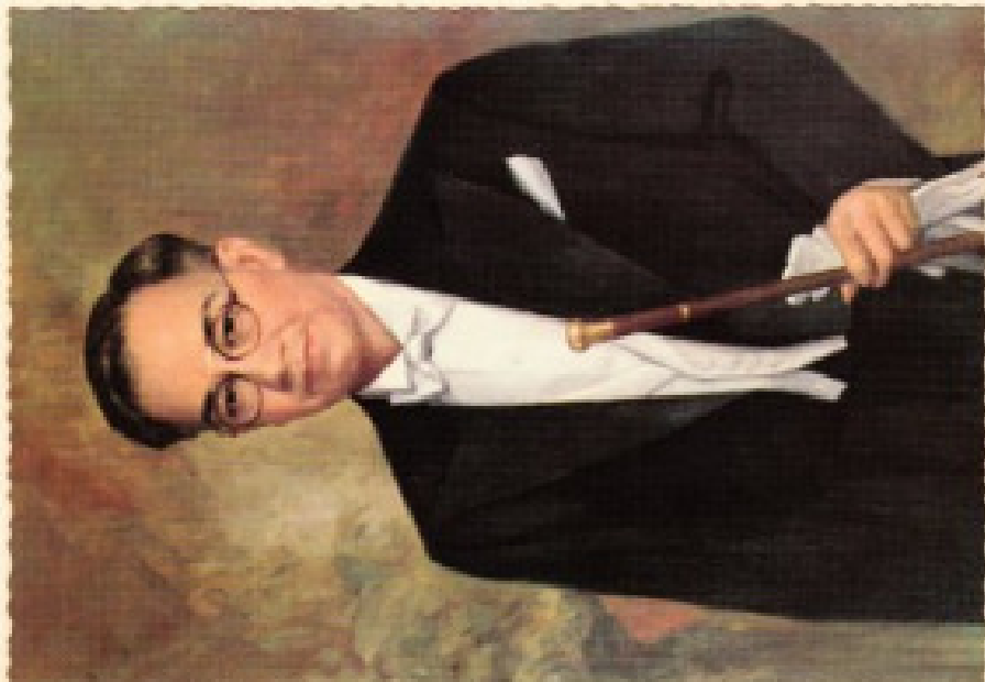
Jose Pascano Laurel

Like a true philosopher, Dr. Laurel reduced the basic ideas of personal and international relations to the simple formula that "Integration and Digestion of the Human Personality" must be the major desideratum of all human efforts and institutions if an "egalitarian" both in the relations of classes within a nation and in the relations of nations on the world stage is to be achieved with inalienable success and durability. His political science came directly from Plato, though he was familiar with, and often quoted, Oriental philosophers and thinkers. No admirer of Dr. Laurel's synthesizing mind reduced the concept of economic and cultural nationalism to a couple of simple