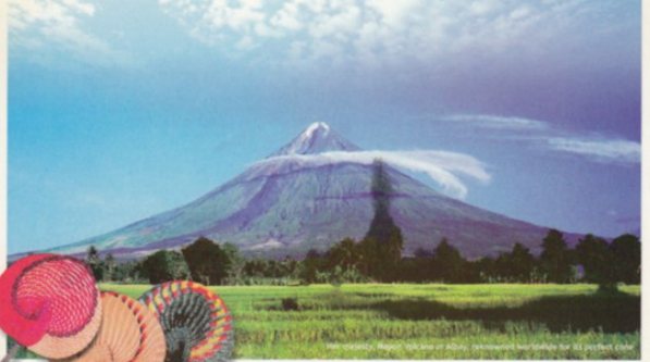
Mount Apo in Mindanao, Philippines, the highest mountain in the Philippines.

WOWPHILIPPINES more than the usual www.wowphilippines.com.ph