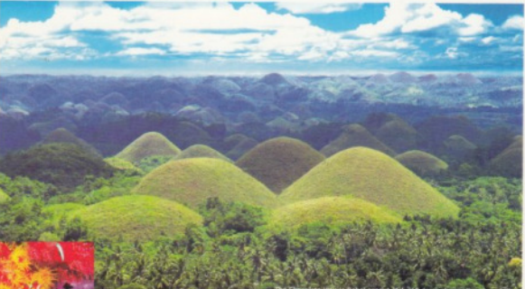
The Chocolate Hills in Bohol consist of 365 conical mounds (approximately 1200).