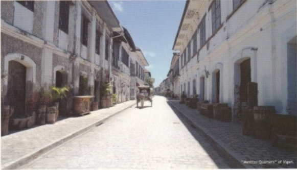
'Barrio Quirino' of Vigan.

WOWPHILIPPINES more than the usual www.wowphilippines.com.ph