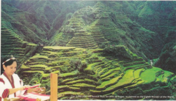
The 2,000-year-old Terraced Rice Terraces of Ifugao, acclaimed as the Eighth Wonder of the World.

WOWPHILIPPINES more than the usual www.wowphilippines.com.ph