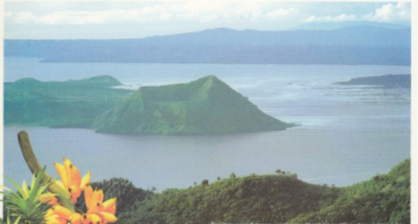
Taal Volcano in Batangas, a volcano within a lake within volcano within a lake