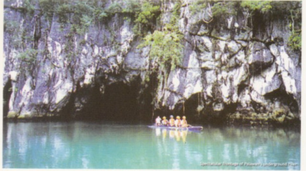
Spectacular Heritage of Palawan's Underground River

WOWPHILIPPINES more than the usual www.wowphilippines.com.ph