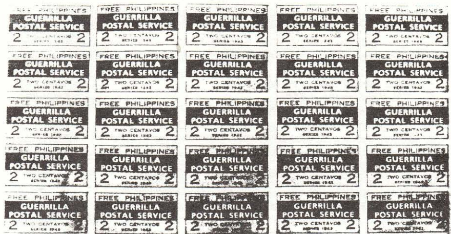
Figure 1. Full sheet of the 2-centavo blue-on-white Philippine Guerrilla stamps issued by the "Free Philippines," 10th Military District, Esperanza, Mindanao.

Virtually all that is known of the stamp is found in a 1949 study 1 by Pablo Esperidion of the Philippines, and a subsequent study in 1961 2 by Arnold H. Warren of the United States.