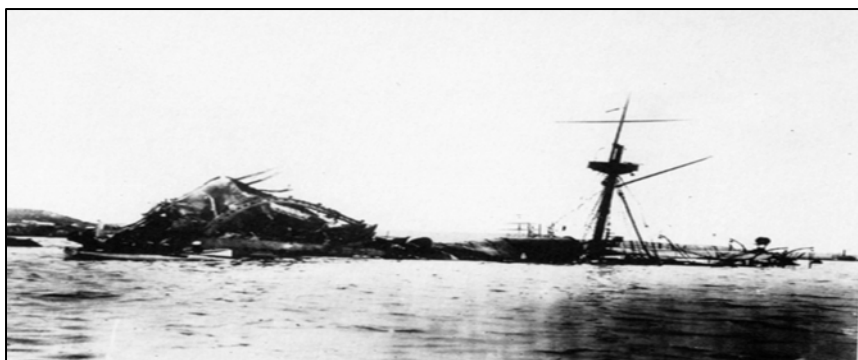
Destruction of the USS MAINE on February 15, 1898, had little effect on Governor-General Rivera, but engulfed his four successors

The start of the New Year was relatively calm with little foreboding of the conflicts to come. From the Spanish viewpoint, control of the uprisings in 1897 through the import of approximately 10,000 additional Spanish troops from Spain in 1897 was welcome news. Governor-General Fernando Primo de Rivera, who began his duties in Manila on April 23, 1897, had little realization that his reign as Governor-General would be the calmest of any of the next four Governors-General. Nor did he or anyone, for that matter, realize that 1898 was to be the last year of over 330 years of Spanish control of the Philippines. The explosive destruction of the USS MAINE in Havana Harbor on February 15, 1898, changed everything. Although it had no immediate effect on Rivera’s reign, a chain reaction of events occurred that quickly engulfed the next four Spanish Governors-General.