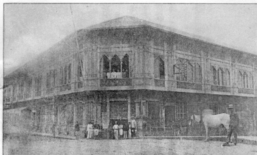
Main Spanish post office in Escolta, Manila, reverted to U.S. control August 14, 1898, at the end of Spanish Governor-General Fermin Jaudenes’ short reign.