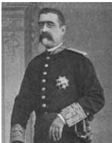
Governor-General Basilio Agustin reigned during a critical period from April 11 through July 24, 1898

August 21, 1898, the telegraph cable to Hong Kong was cut at Bolinao, its landing location, on orders from Commodore Perry. However, I believe the latter date may be incorrect because there is some evidence that overseas telegraph communications resumed from Manila about the 3 rd week in July. In any event, since the Americans controlled the cable, they also controlled the ability of Agustin and subsequent Governors-General to communicate with Spain. On May 19, Emilio Aguinaldo returned to Manila from exile in Hong Kong and established a revolutionary government against the Spanish. On May 25, the first U.S. troops were sent from San Francisco to the Philippines, and on June 12, 1898, Aguinaldo declared Philippine independence from Spain. As they say, this was not a “good day” for Governor-General Agustin.