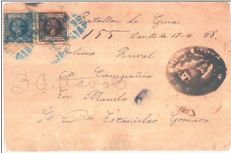
1898 (June) small town on Luzon to Manila from Spanish soldier with Spanish military cachet, routed through the still-operating Spanish-run Manila post office.