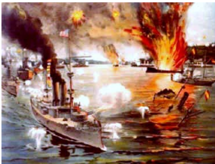
The Battle of Manila Bay on May 1, 1898, was a disaster for Spanish Governor-General Basilio Agustin.