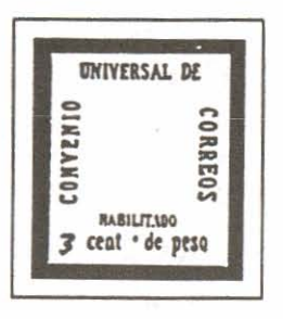
Figure 2. 3-Centavos de peso surcharge on the September, 1879, postal card.

typeset and was done in Manila as we shall later discuss. The words of the surcharge "CONVENIO UNIVERSAL DE CORREOS" mean "Universal Postal Union." The word "HABILITADO," which appears on many stamps of Spain and her colonies, means that the stamp was revalidated and made legal for use, usually to validate a change in the government or monetary system. In this case, it validated the use of the new UPU system, specifically the new UPU rates.